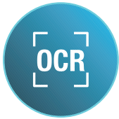
Optical Character Recognition

Higher Duty Cycles and Periodic Maintenance Intervals provide greater volume with fewer routine service calls so you can stay focused on productivity.