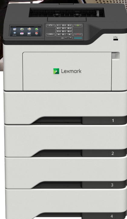
M3250 with optional trays